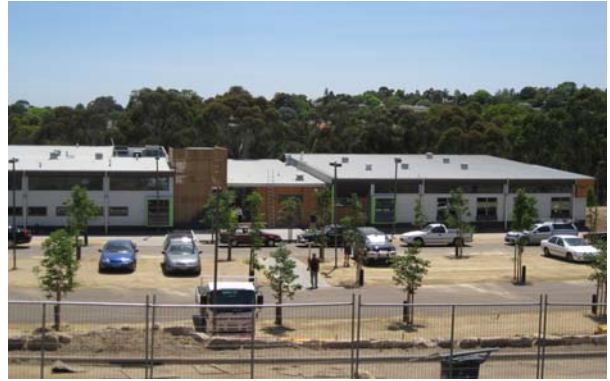
The new premises

little bridge with friends! We plan to run irregular Sunday Green Point competitions, informal days to have fun, share a slice or two of pizza and indulge in a little friendly good quality bridge. Other clubs will be able to make use of the rooms for Congresses.